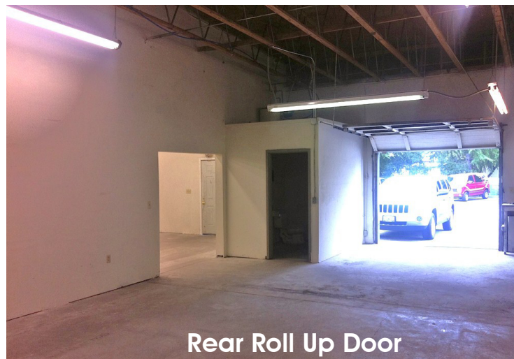
Rear Roll Up Door